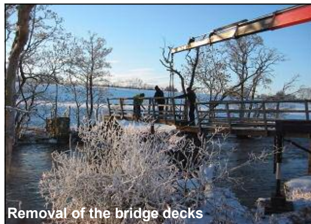
Removal of the bridge decks

The repair and replacement of footbridges continues apace as part of the flood recovery programme. The “Iron Bridge” as it is known locally, crosses the River Eden at Sockbridge near Penrith, and was severely damaged during the flooding of Nov 2009. Because the bridge piers were in a hazardous condition the bridge deck was removed on safety grounds when it became clear that people were still using it—despite it being closed—and to save the bridge deck before it collapsed into the river. The three bridge decks were removed and placed in storage for use elsewhere before Christmas.