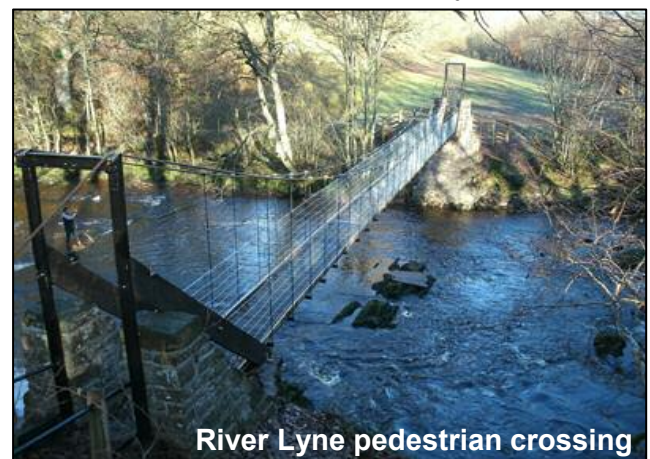
River Lyne pedestrian crossing

A historic suspension bridge crossing the River Lyne north east of Carlisle has now been fully restored thanks to Cumbria County Council's countryside access team. The footbridge, known as Chainfoot at Roweltown near Hethersgill, provides the only pedestrian crossing of the River Lyne for three miles between road bridges. It is set in a secluded location upstream of an ancient ford crossing and serves as a link to the existing public rights of way network on both sides of the river. Last year one of the two support cables for the bridge snapped, which prompted a full refurbishment of the whole structure, including repairs to the stone masonry abutments. The work, which demanded a bespoke solution, was carried out by a local contractor supervised by the Countryside Access team.