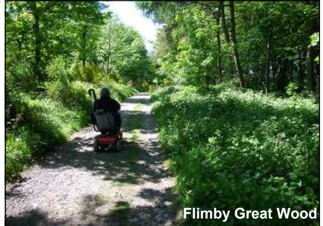
Flimby Great Wood

The pilot scheme also included work in Soulby Parish (Eden), Lazonby (Eden) and Pennington (South Lakes).