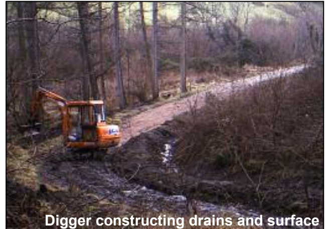
Digger constructing drains and surface

Whilst on site our contractors have received many positive comments from local people using the route and walkers undertaking the full 70 mile challenge. The work has also been widely supported by both Caldbeck and Sebergham parish councils.