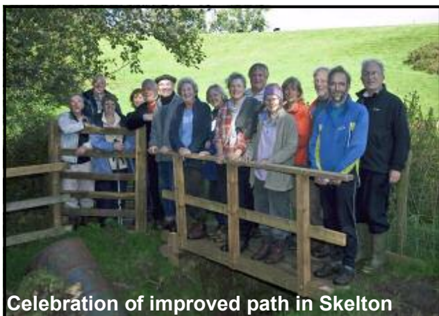
Celebration of improved path in Skelton

Several groups also attended a number of workshops we held in several locations as part of our PPI road show. New-comers received information on public rights of way and how to get involved and plan a project through PPI.