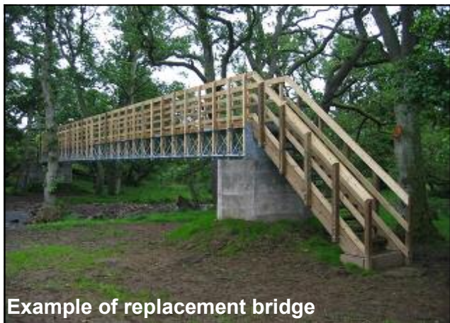
Example of replacement bridge

The new bridge will be constructed of timber and steel, and the cut sandstone from the collapsed piers of the old bridge used to rebuild the abutments. The new bridge will be a single-span structure and raised at a higher level so that it will be more resilient to future flooding. Construction will start in June 2011, subject to consent from the Environment Agency and the appointment of a suitable contractor. The new structure will look similar to the one pictured left at Milburn, built by the county council in 2009.